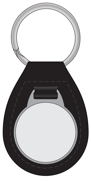
100% of Actual Size Resin Dome